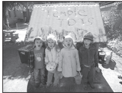
Temple Tots kids loved playing in the snow this winter!!!